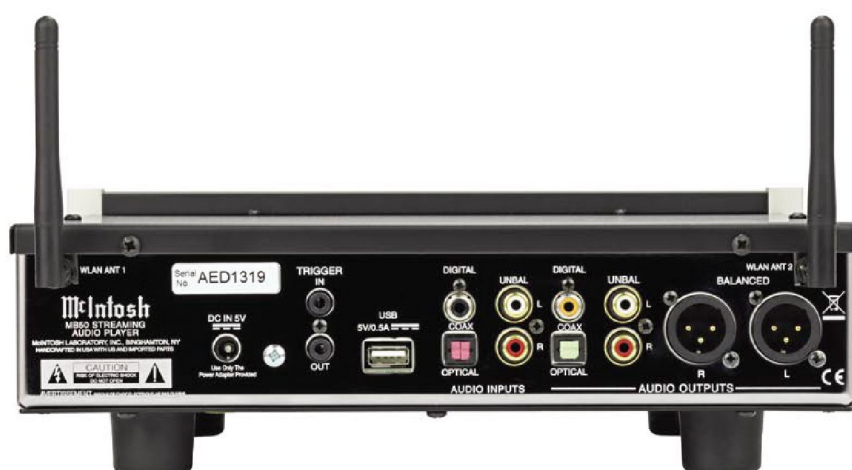
The MB50 has two antennae for a secure wi-fi connection plus balanced and unbalanced analogue outputs as well as a full range of digital in and out connections.

Moving to CD-quality streaming from Tidal with Django Bates and the 14-piece Frankfurt Radio Big Band and their