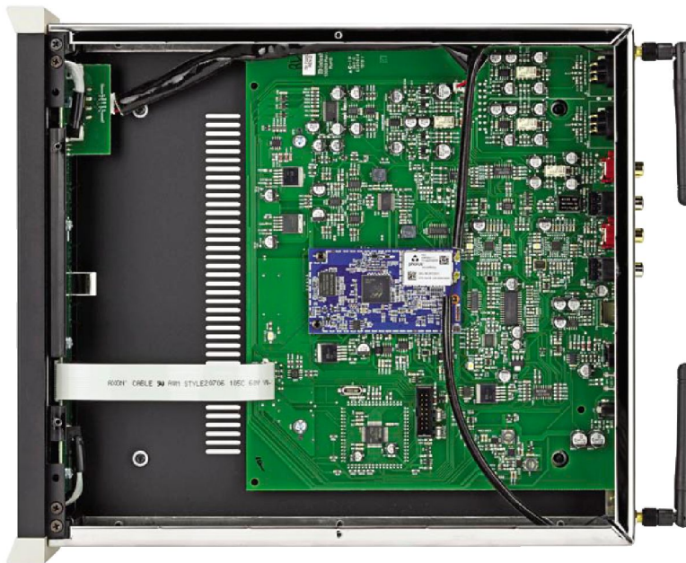
The neatly laid-out circuitry of the McIntosh MB50. Note the two wi-fi antenna on the rear for a more stable network connection.